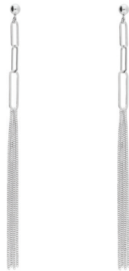
Tassels on Paper Chain Earrings In Sterling Silver & Yellow Gold-Plate