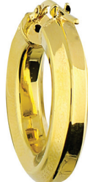
Hexagonal Hoop Earrings in Sterling Silver & Yellow Gold-Plate H5108/S H5108/Y