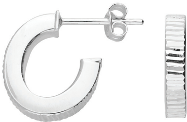
Three Quarter Ribbed Stud Hoop Earrings in Sterling Silver H5198/S