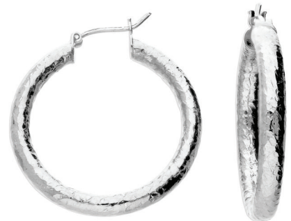
Snakeskin Tube Hoop Earrings in Sterling Silver & Yellow Gold-Plate H5168/S H5168/Y

Please note, only products that are part of the Italian Collection are described. However, all products are available from CME via the website .