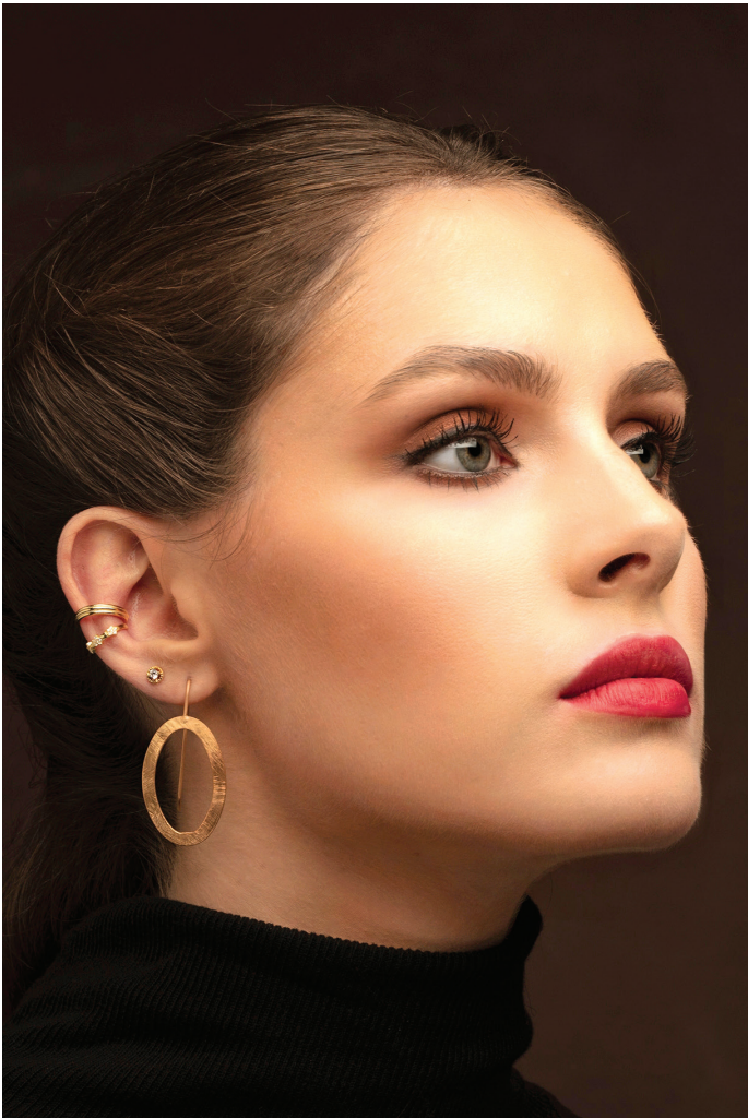
Satin Finish Large Hook-In Drop Earrings in Yellow Gold-Plate