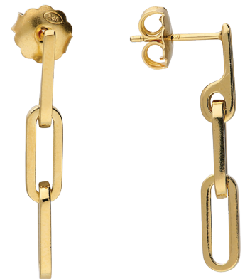
Paper Chain Earrings In Sterling Silver & Yellow Gold-Plate H5167/S H5167/Y