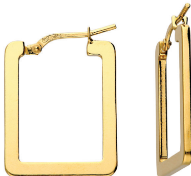
Rectangular Creole Hoop Earrings in Sterling Silver & Yellow Gold-Plate H5169/S H5169/Y