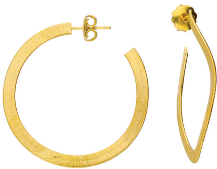
Satin Finish Hoop Earrings In Yellow Gold-Plate