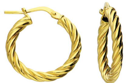
Soft Twist Creole Hoop Earrings In Sterling Silver & Yellow Gold-Plate