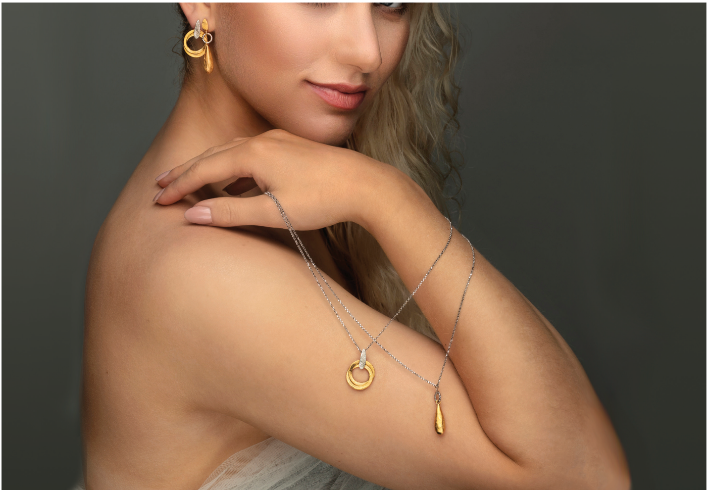
Two-Tone Satin Finish Double Circle Earrings H4718/Y