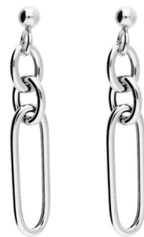
Oval Link Paper Chain Earrings in Sterling Silver H4172/S