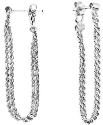
Double Rope Chain Earrings In Sterling Silver & Yellow Gold-Plate H4823/S H4823/Y