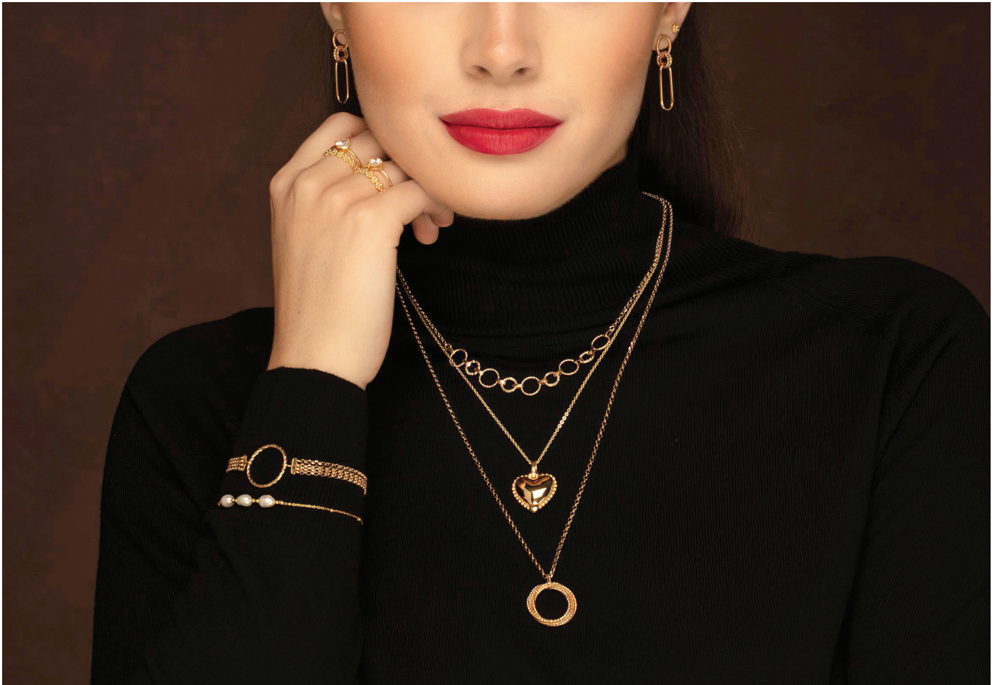
Diamond Cut Circle Drop Earrings in Yellow Gold-Plate H5171/Y