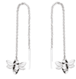
PULL-THROUGH BEE EARRING Finish: Sterling Silver Code: H2948/S Size: 10mm (h) x 12mm (w)