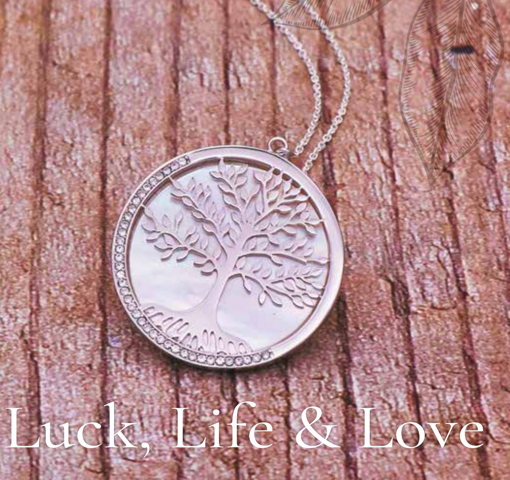
MOTHER-OF-PEARL TREE OF LIFE DISC PENDANT WITH CUBIC ZIRCONIA RIM Finish: Sterling Silver Code: H2915/S Size: 30mm diameter

GOOD LUCK HORSESHOE CHARM Finish: Sterling Silver Code: 2475 Size: 12mm (h) x 12mm (w)