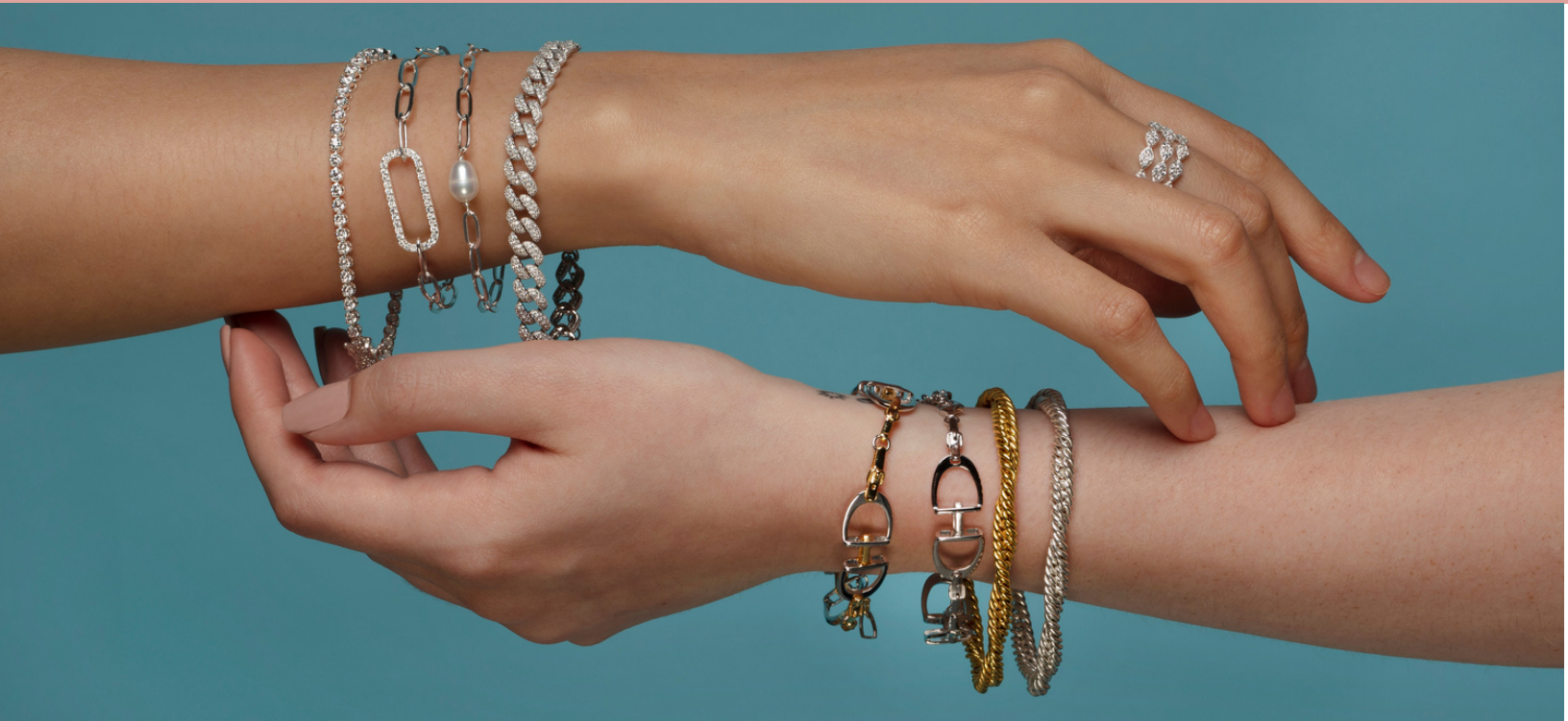
[Top: CZ Tennis H5797/S, Single Pearl H5804/S Bottom: Stirrup Bracelet H5655/S/Y, Reverse Twist H5623/S/Y ]

We start by picking the products. As we tend not to have a traditional 'range per season' we aim to feature both new items and some of our existing popular products. This time we selected new amber, colour, pearl and sparkle for the coming party season.