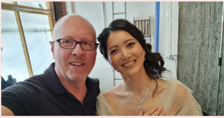
Chohee is a great model and an amazingly talented pet photographer <u>www.choeheecourtoise.co.uk</u>